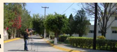
Tele Lumiere at Beth Mallat- Mexico