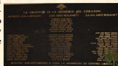
A List of the founders at the doorway