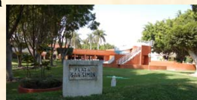
St Simeon Garden- Beth Mallat