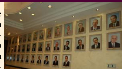
Photos reviving the memory of the members of the Lebanese Association

Tuesday June 30th 3.00 LEB- 00.00GMT- 20.00EST