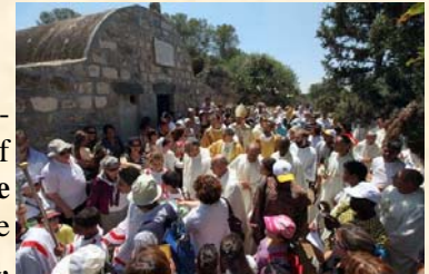
The Franciscan Friars reviving the memory of the transfiguration on Mount Tabor