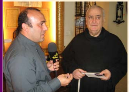
Receiving the relics of Saint Giuseppe Da Copertino.