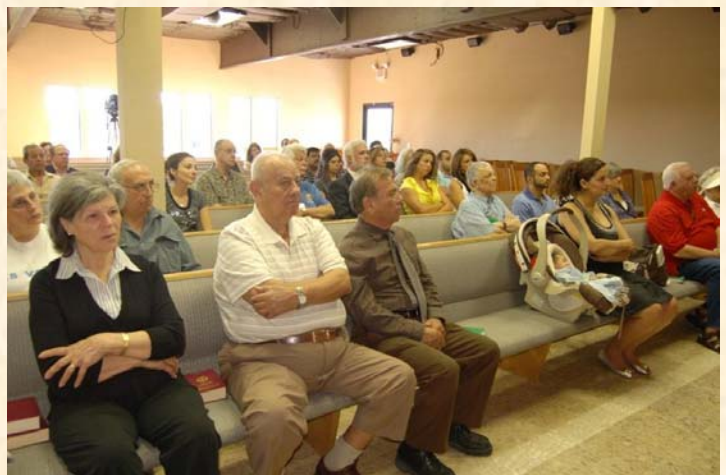
St Sharbel parishioners