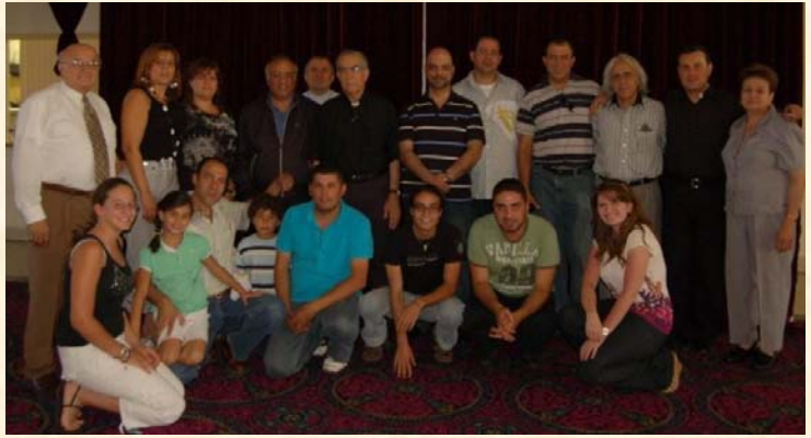
A memorial photo of Tele Lumiere delegation with the parishioners

A year after the foundation of St Sharbel in Las Vegas , Tele Lumiere visited it and filmed a documentary showing this event. Interviews with the parishioners were filmed in addition to the Divine Liturgy that will be broadcast soon on Tele Lumiere .