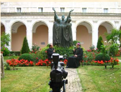
Interview with the prior of the convent of St Benedict in Monte Cassino.