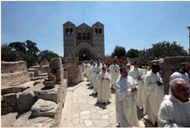
A procession to the oratory