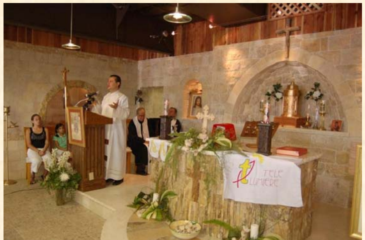
The church Front: The altar, the tabernacle, the stone building such as the Lebanese Maronite churches.